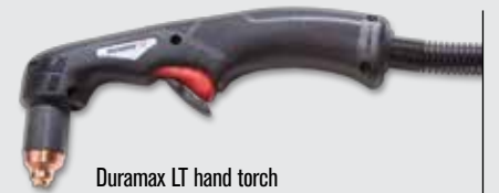
Duramax LT hand torch